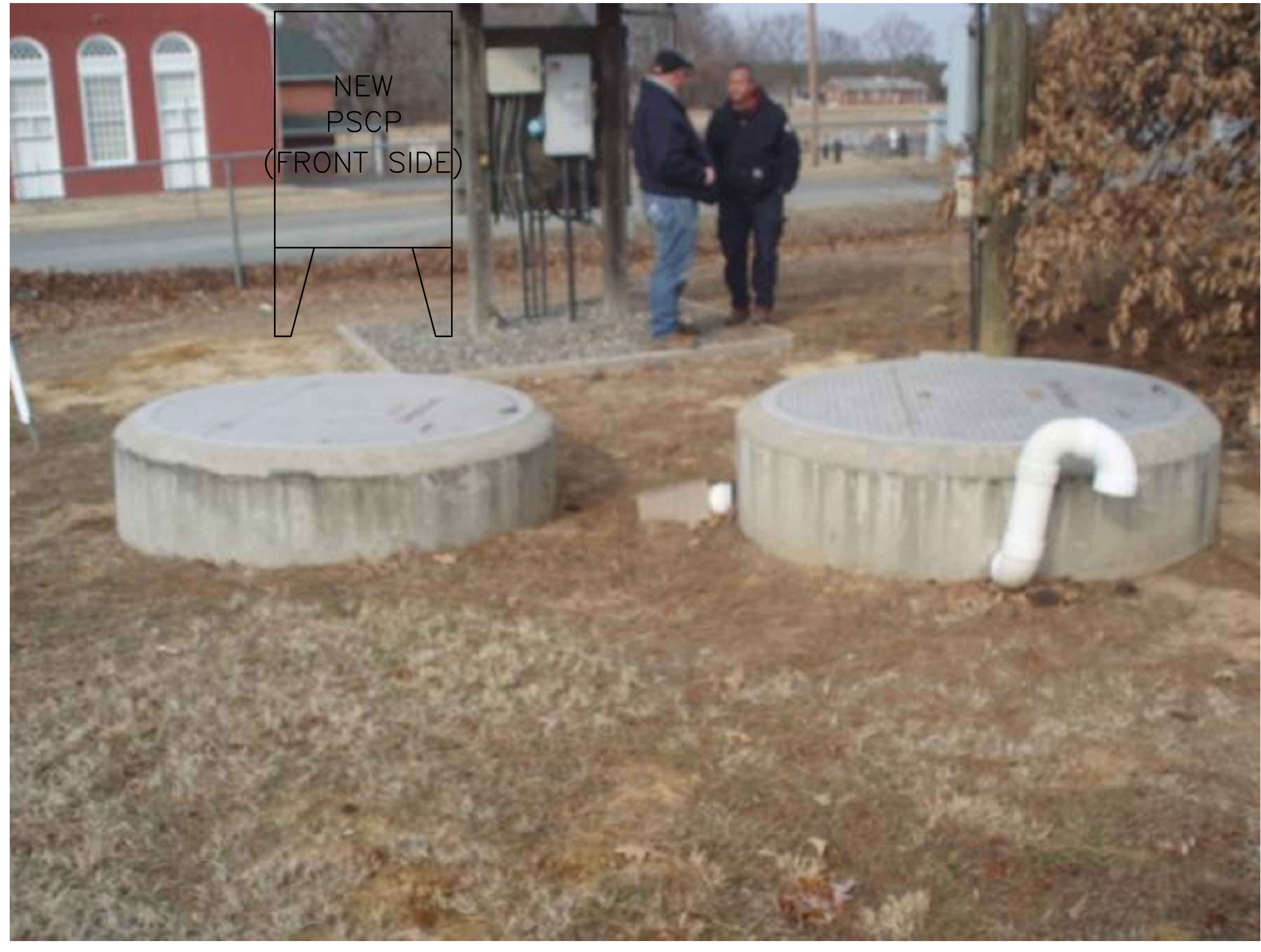
3 WELL LOCATION SCALE: NOT TO SCALE