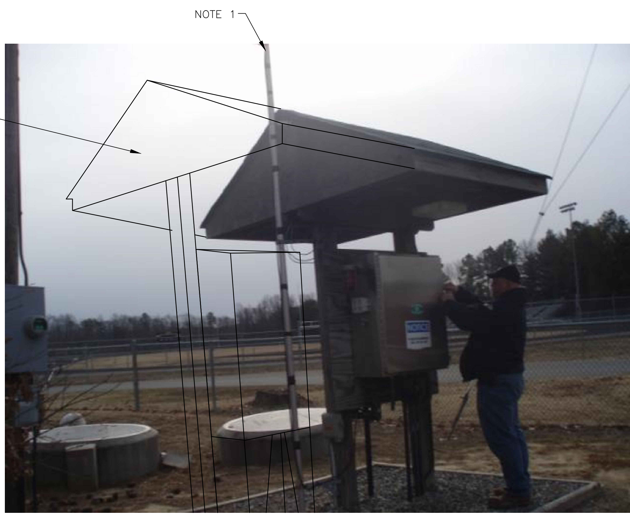
2 EXISTING ANTENNA LOCATION SCALE: NOT TO SCALE

EXTEND THE ROOF PER DETAIL H ON DRAWING G-42. THE PROFILE AND SHINGLES SHALL MATCH THE EXISTING.