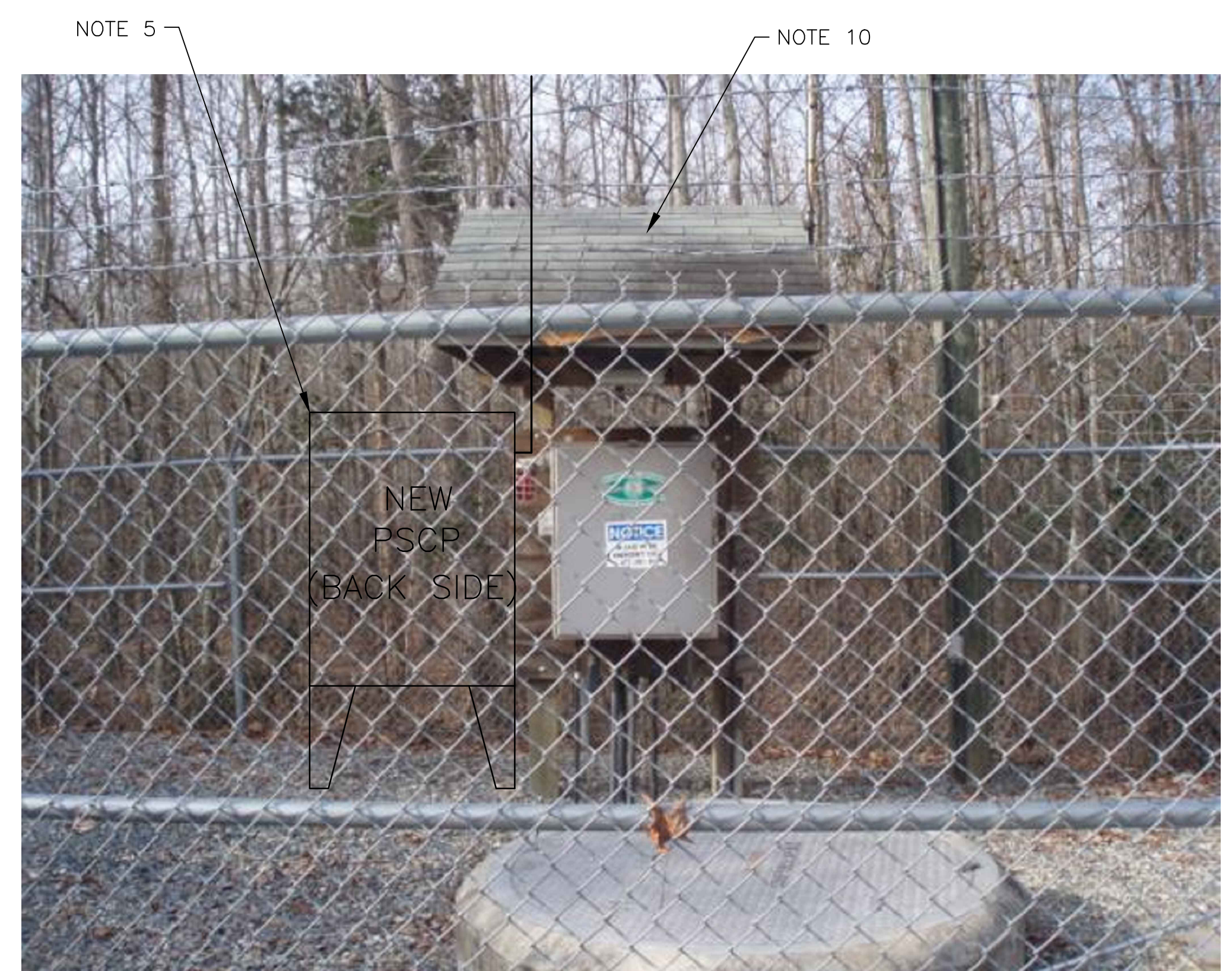
3 FRONT ELEVATION SCALE: NOT TO SCALE