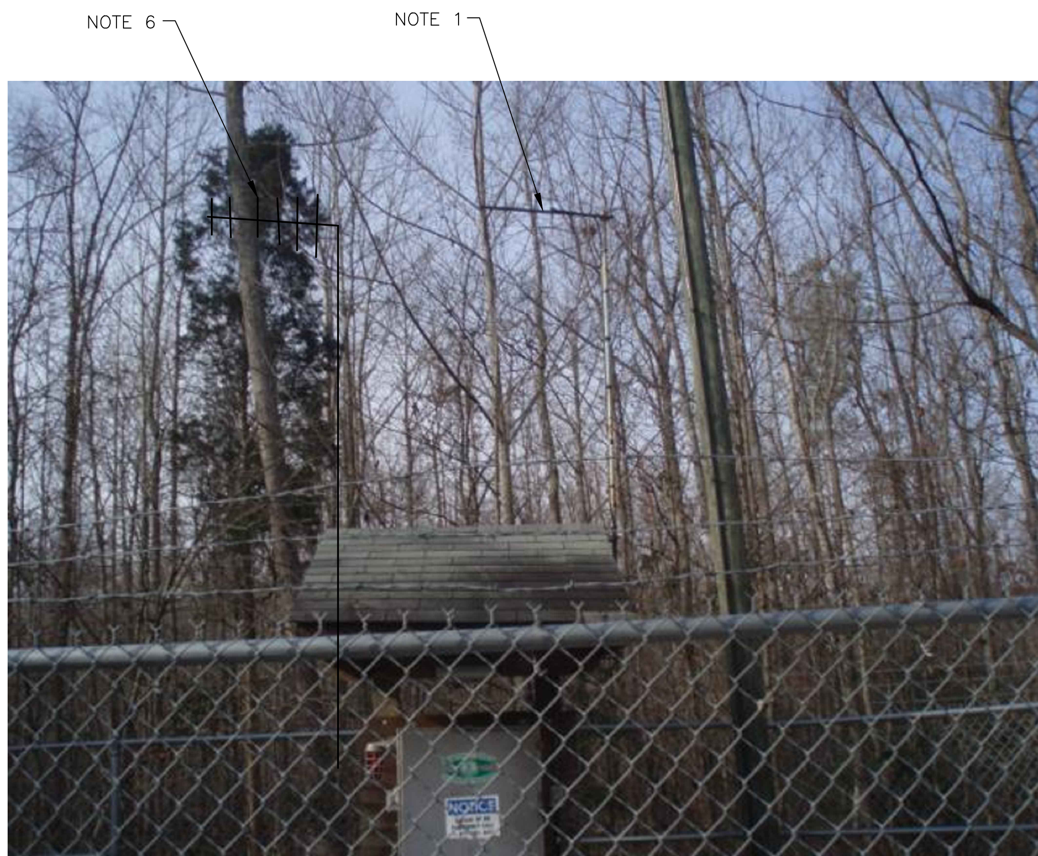
2 ANTENNA LOCATION SCALE: NOT TO SCALE