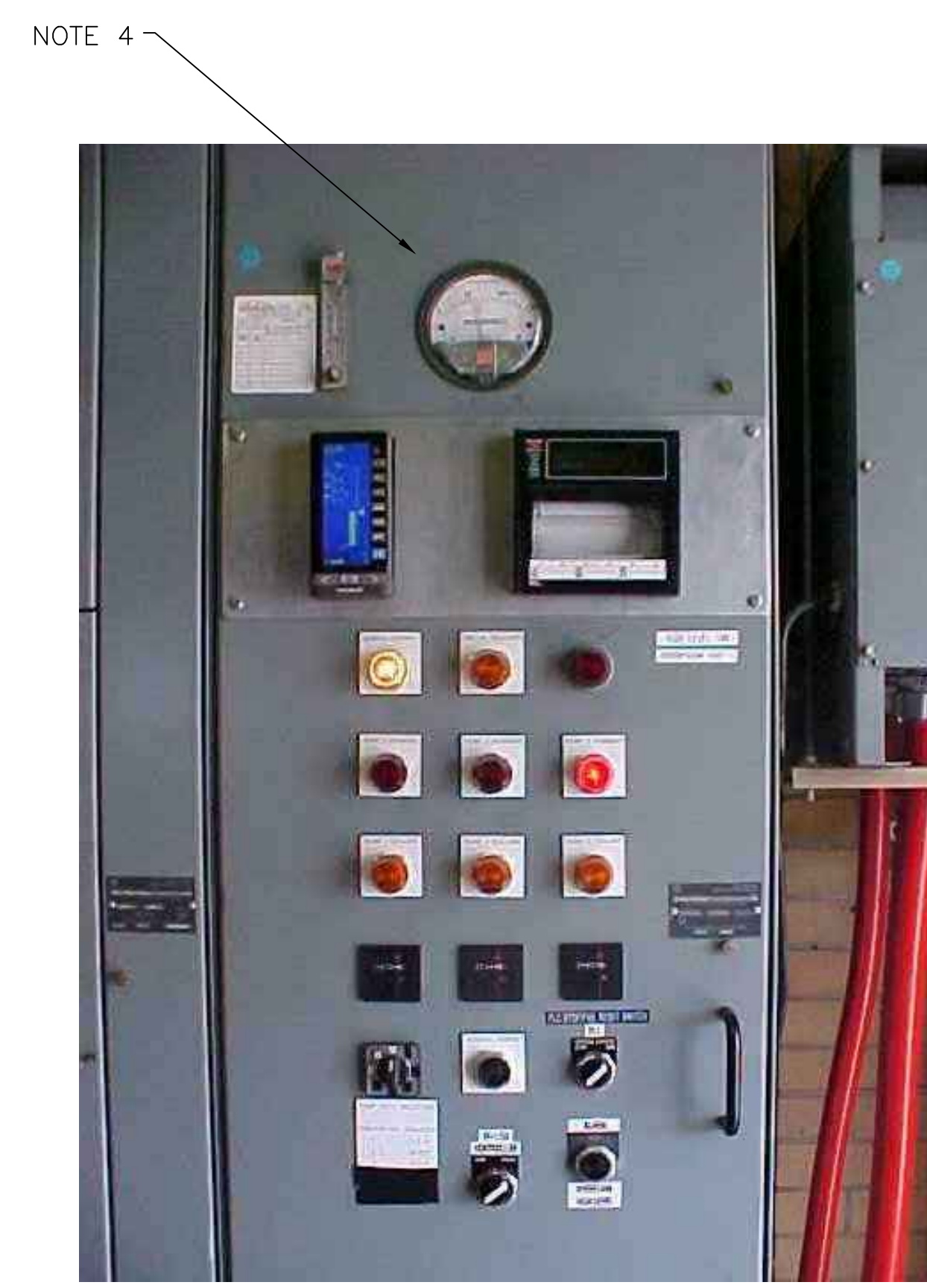
4 EXISTING CONTROL PANEL SCALE: NOT TO SCALE