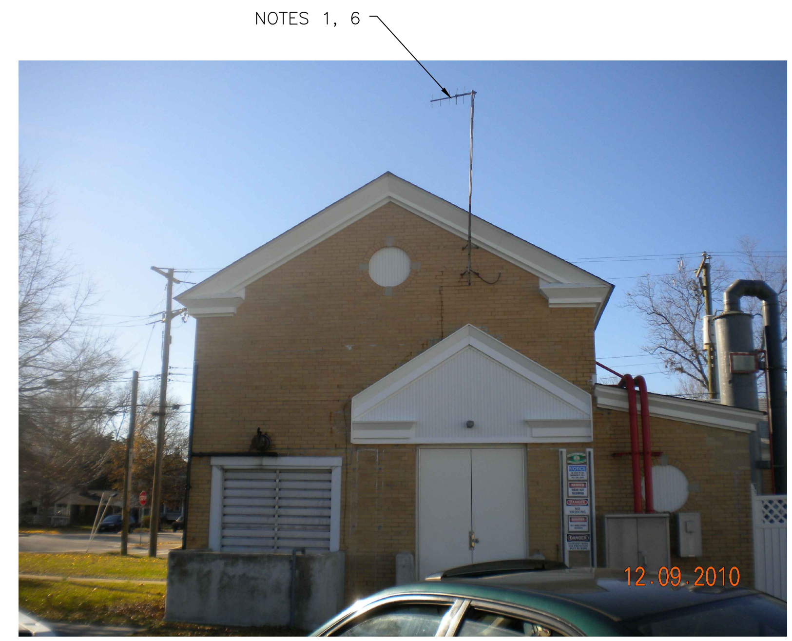
2 EXISTING ANTENNA LOCATION SCALE: NOT TO SCALE