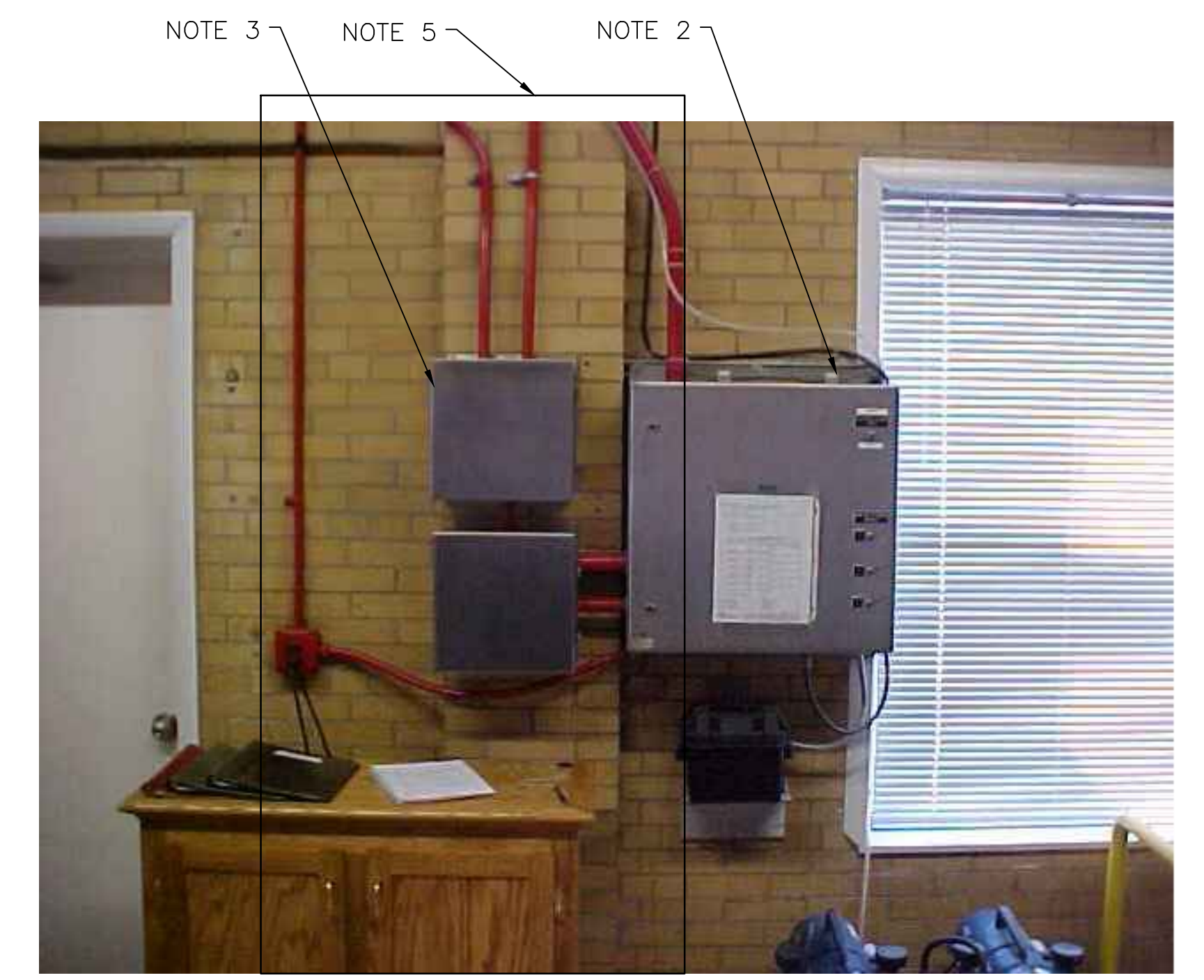
3 EXISTING MOSCAD PANEL SCALE: NOT TO SCALE