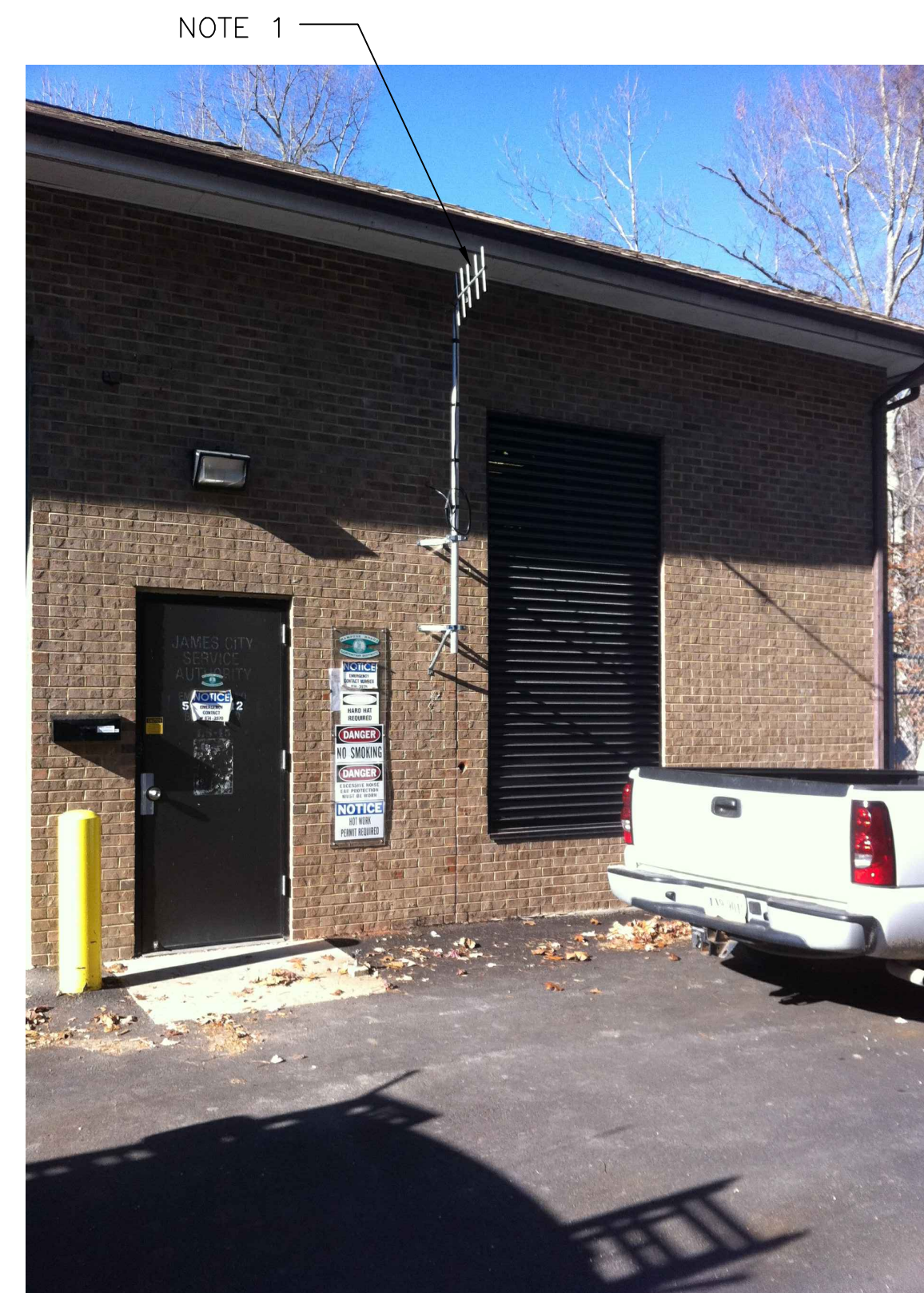
2 ANTENNA LOCATION SCALE: NOT TO SCALE