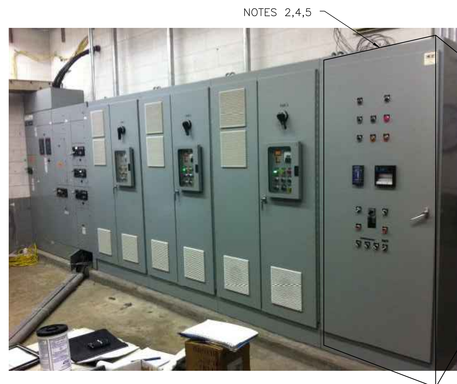
3 EXISTING CONTROL PANEL SCALE: NOT TO SCALE