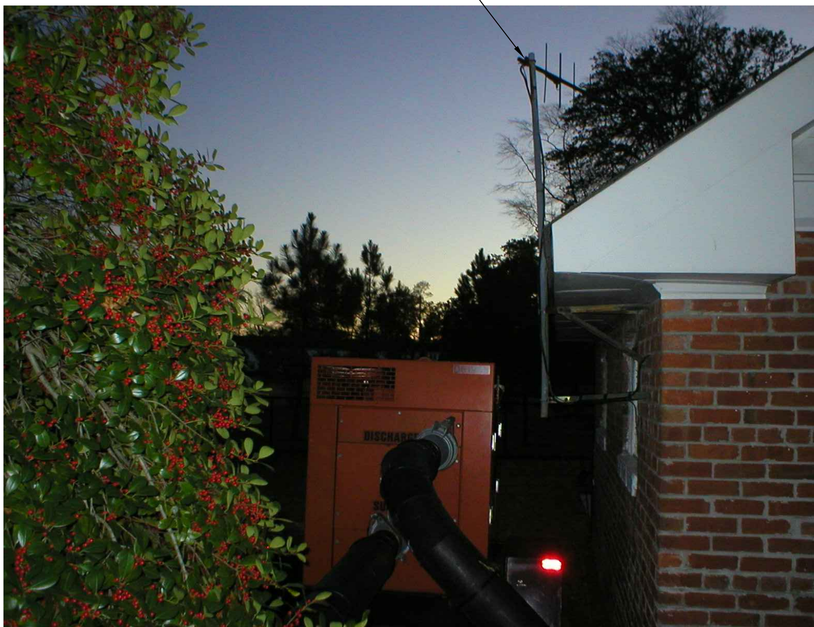
2 EXISTING ANTENNA LOCATION SCALE: NOT TO SCALE