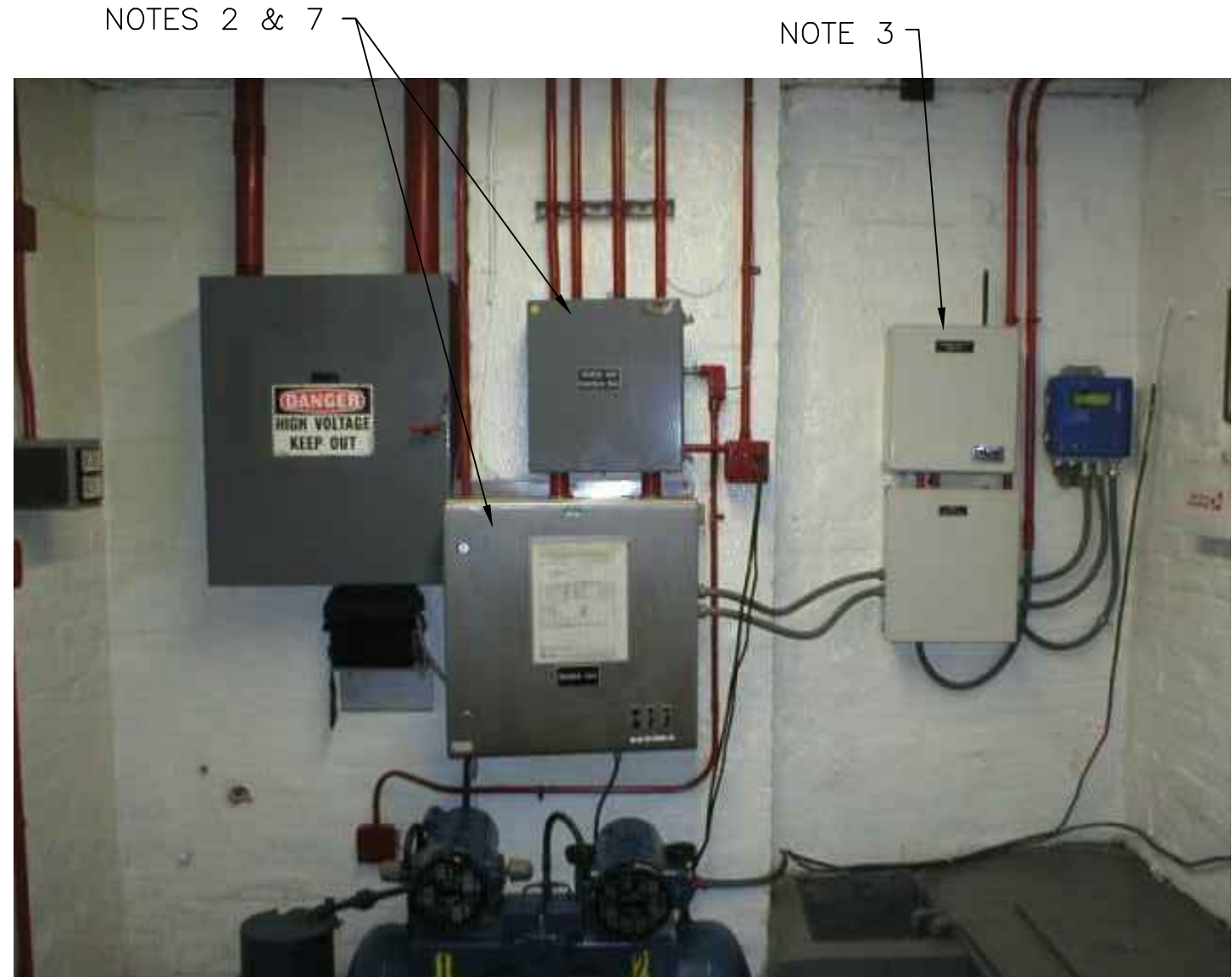
3 EXISTING PANEL LOCATION SCALE: NOT TO SCALE