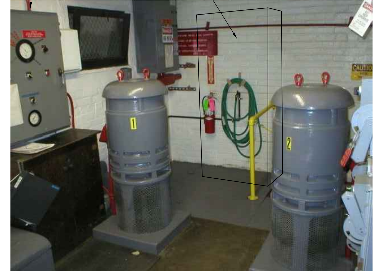
4 NEW CONTROL PANEL LOCATION SCALE: NOT TO SCALE