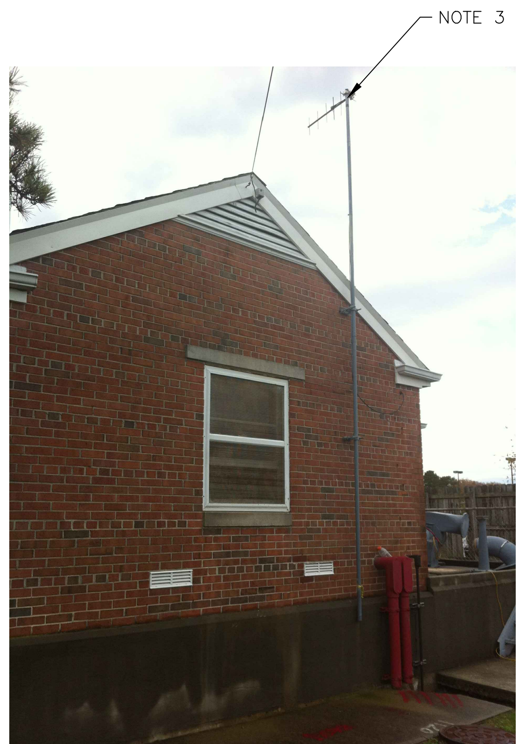
2 EXISTING ANTENNA LOCATION SCALE: NOT TO SCALE