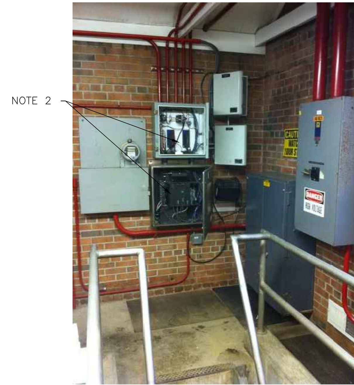
3 EXISTING PANEL LOCATIONS SCALE: NOT TO SCALE