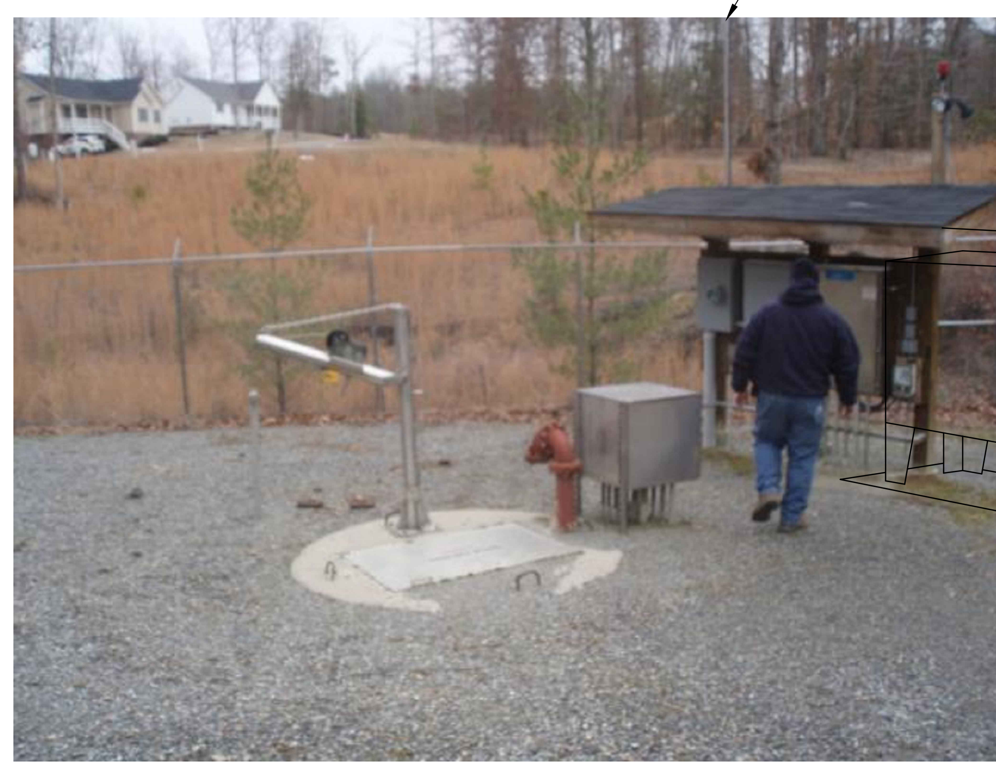
2 ANTENNA LOCATION SCALE: NOT TO SCALE