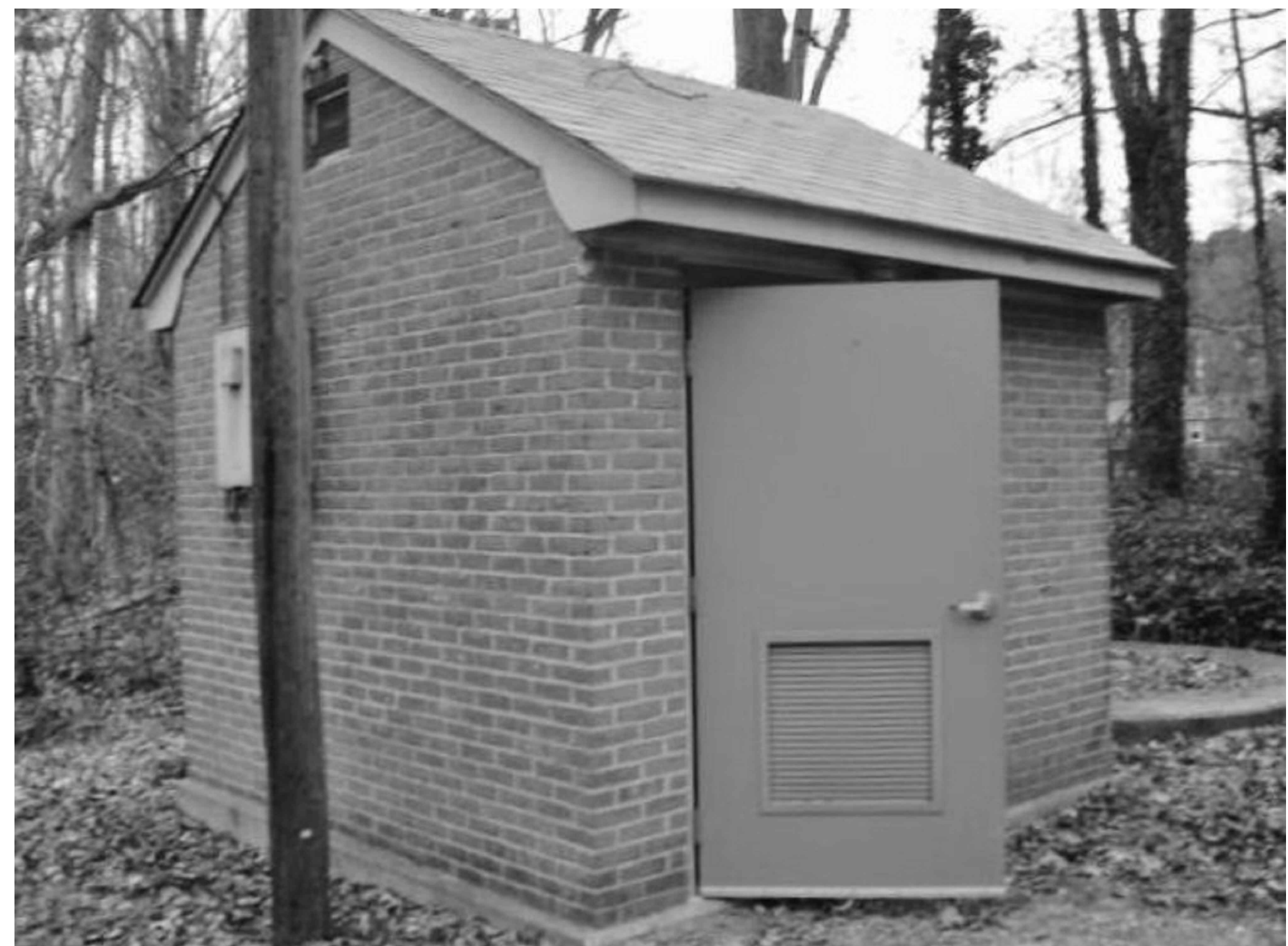
2 ANTENNA LOCATION SCALE: NOT TO SCALE