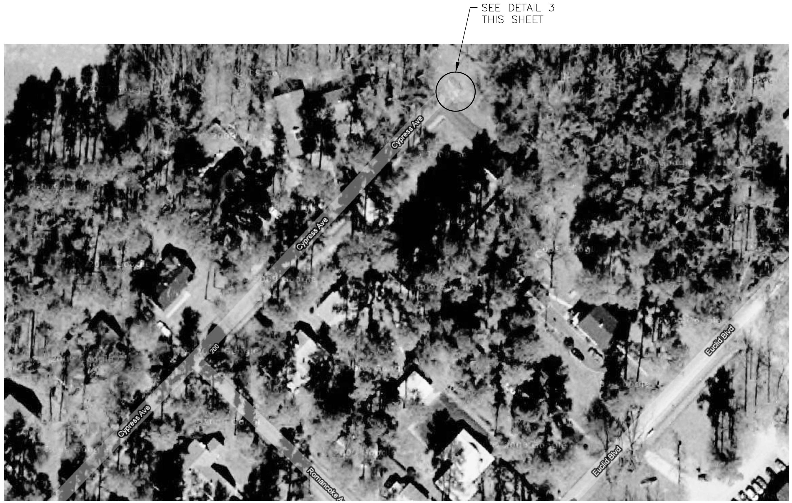
1 SITE PLAN SCALE: NTS