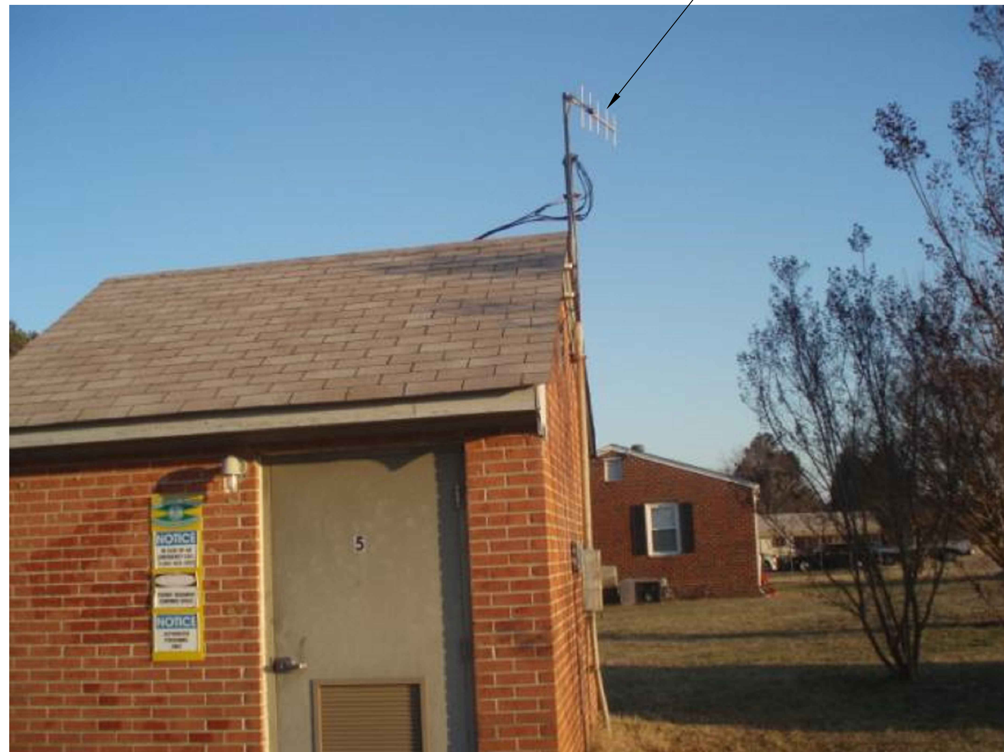
2 ANTENNA LOCATION SCALE: NOT TO SCALE