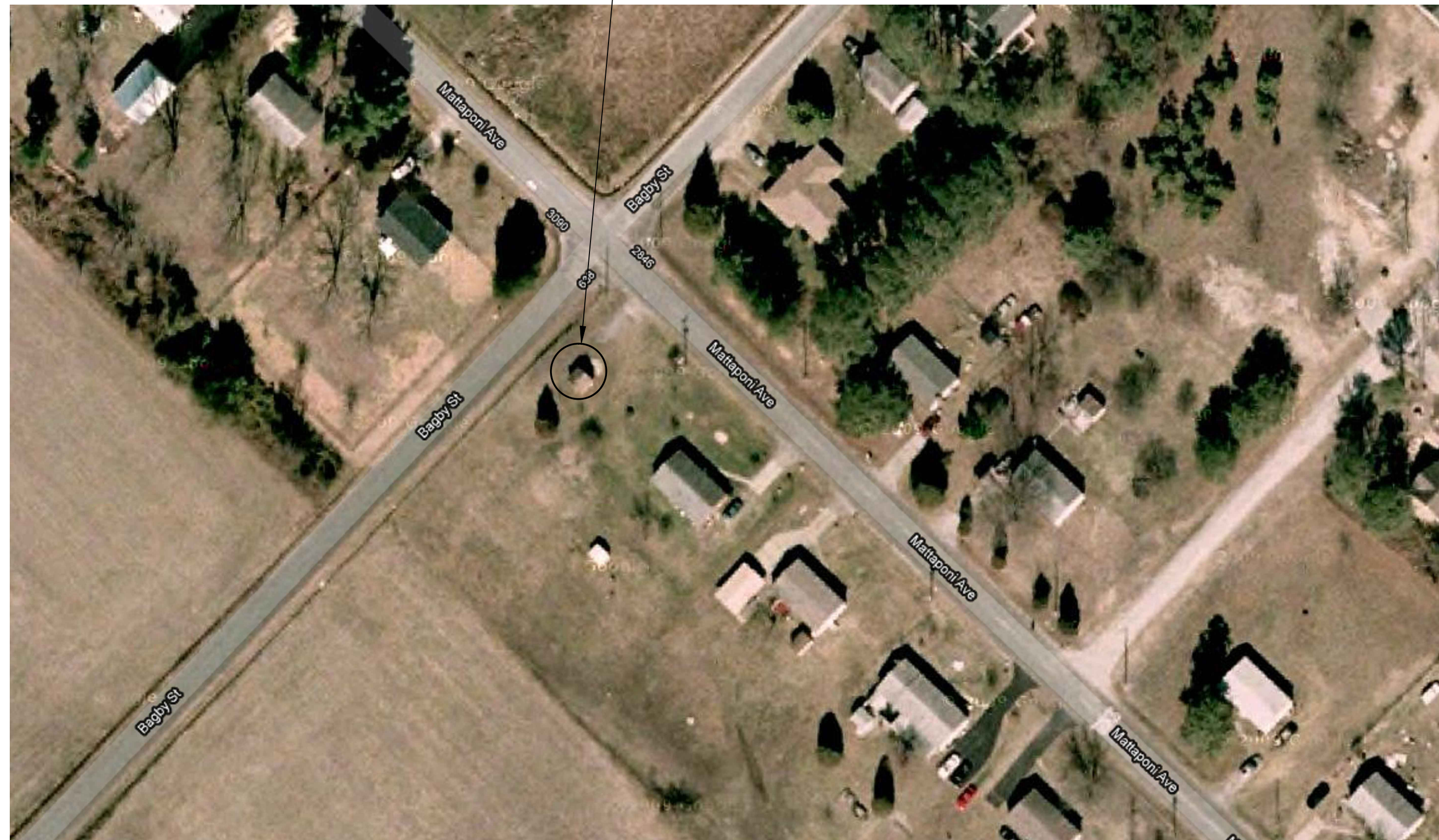
1 SITE PLAN SCALE: NTS