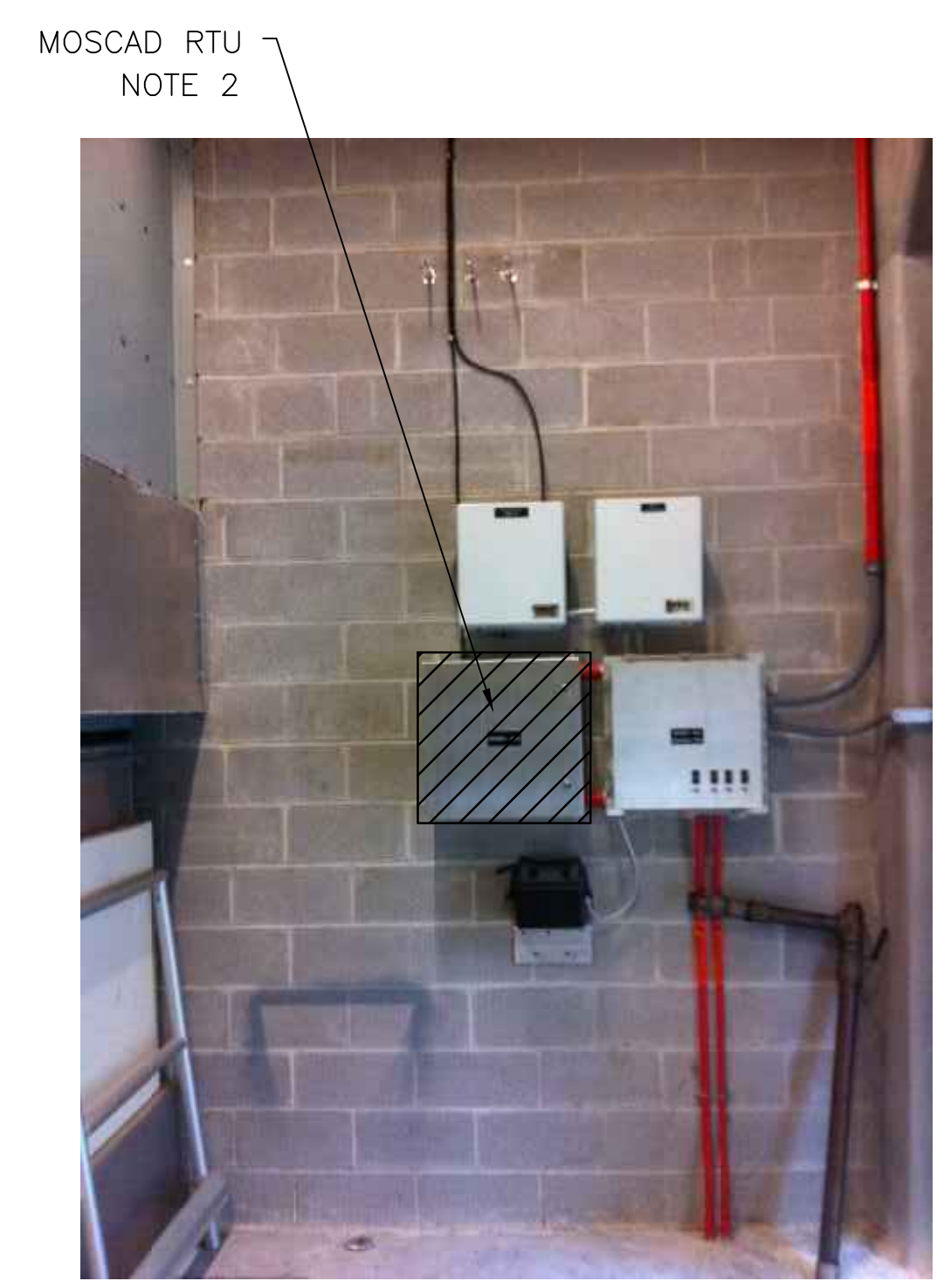
3 EXISTING MOSCAD PANEL SCALE: NOT TO SCALE