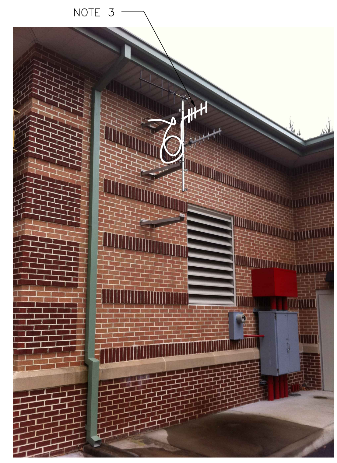
2 ANTENNA LOCATION SCALE: NOT TO SCALE