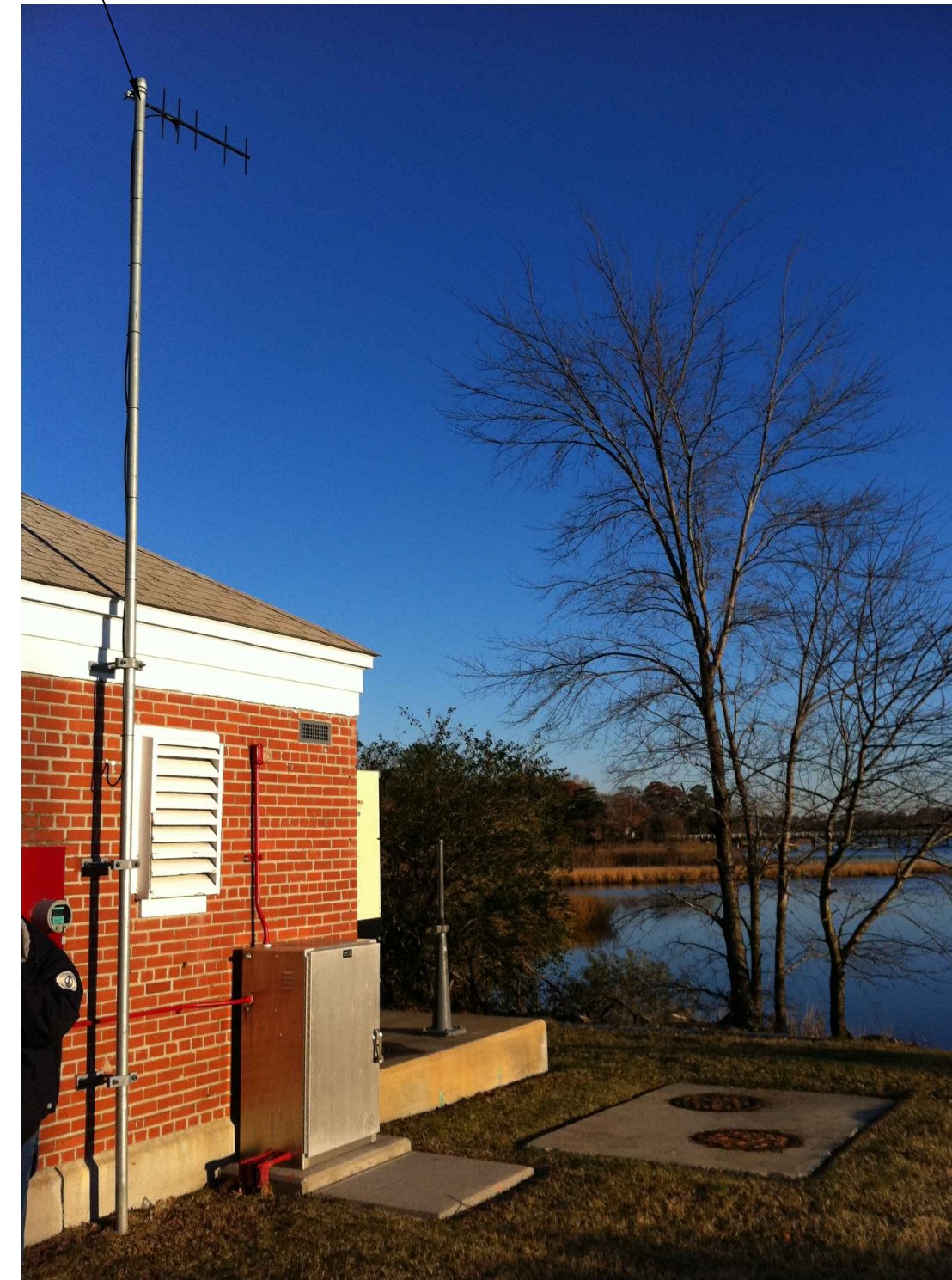
2 EXISTING ANTENNA LOCATION SCALE: NOT TO SCALE