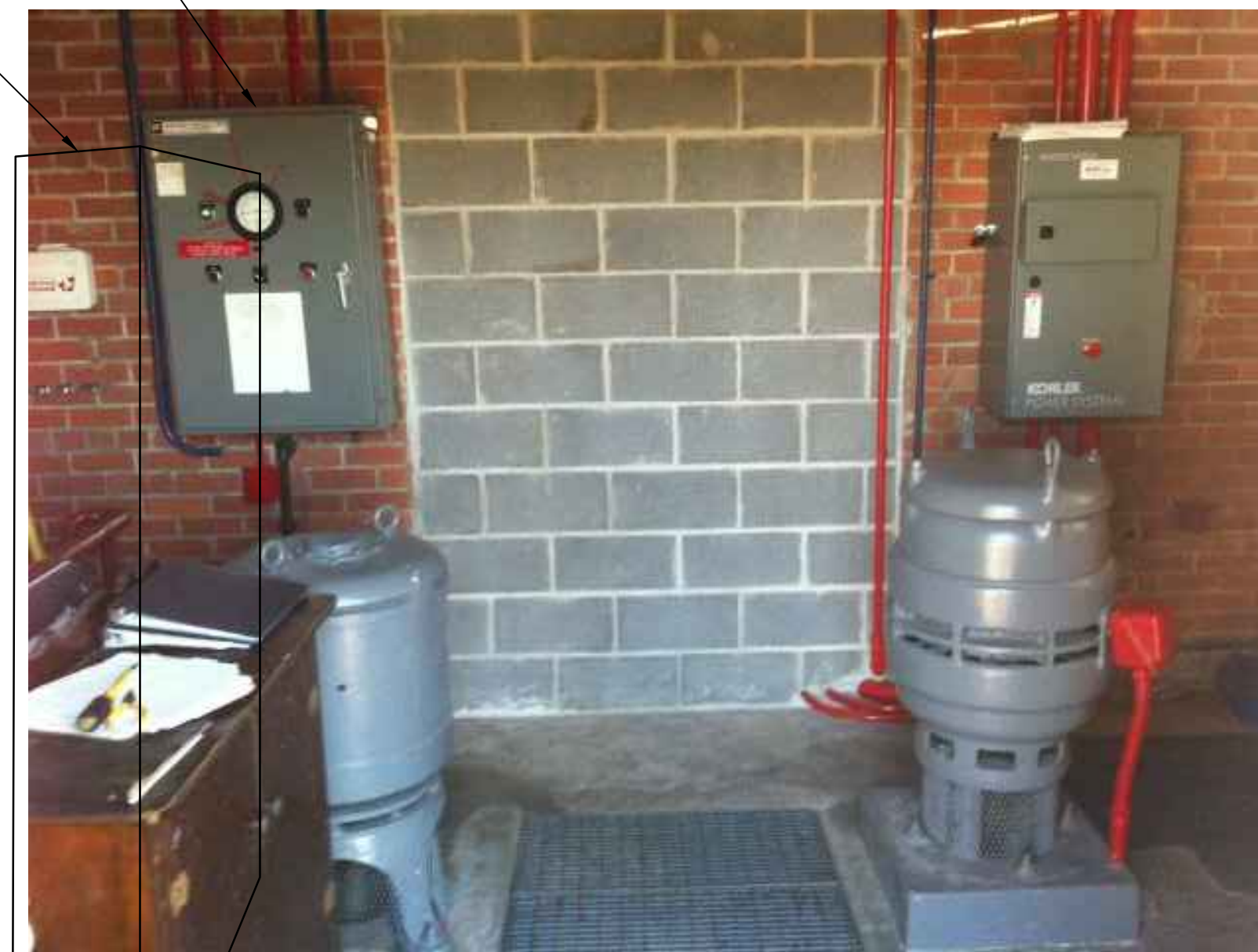
3 EXISTING PANEL LOCATION SCALE: NOT TO SCALE