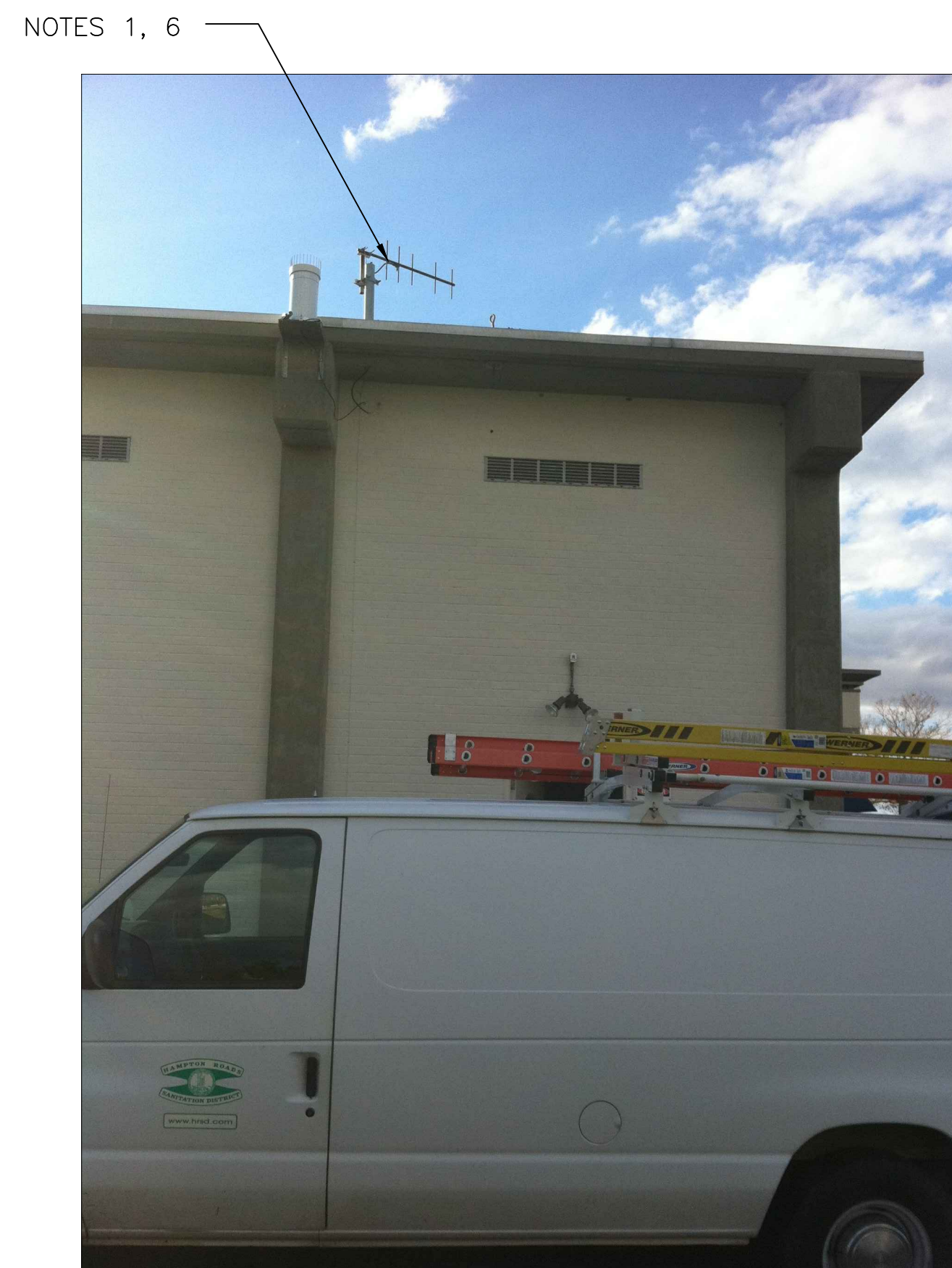
2 EXISTING ANTENNA LOCATION SCALE: NOT TO SCALE