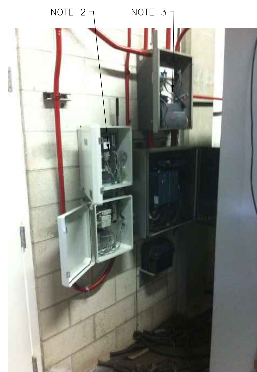
3 EXISTING MOSCAD PANEL SCALE: NOT TO SCALE