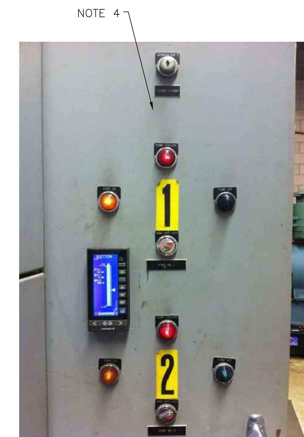
4 EXISTING CONTROL PANEL SCALE: NOT TO SCALE